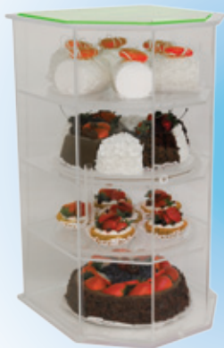
Pie & Pastry Case