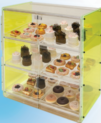
Countertop Pastry Case