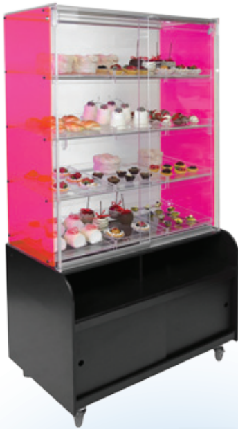
Mobile Pastry Case