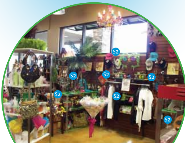
2011 CSNews Store Design-Best Interior Design Frontier Fuel Co. Express Lane/Juan Burrito Dalhart, Texas